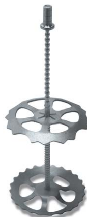
16mm OPT-16 OPT-16T(Tilttable)