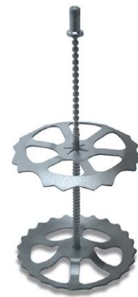
20mm OPT-20 OPT-20T(Tilttable)