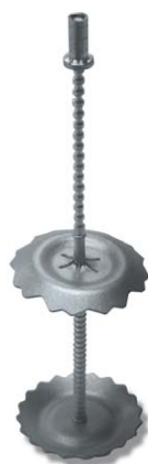
12mm OPT-12 OPT-12T(Tilttable)